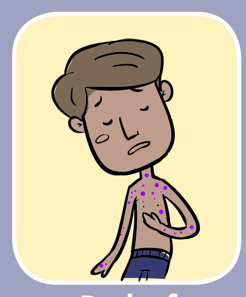
Rash of purple spots