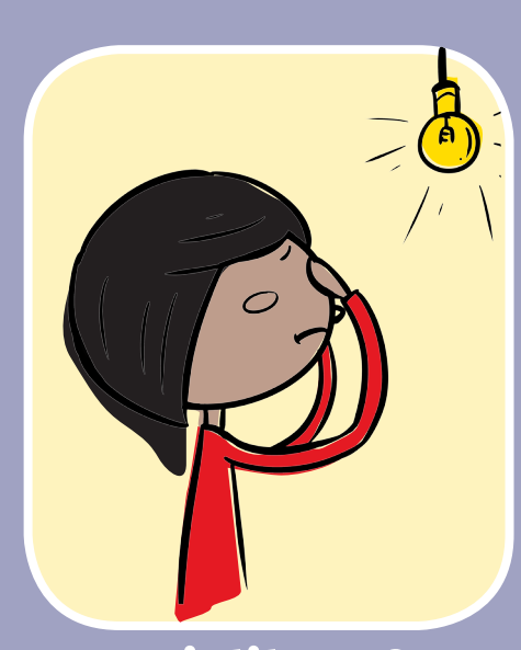
Dislike of bright lights