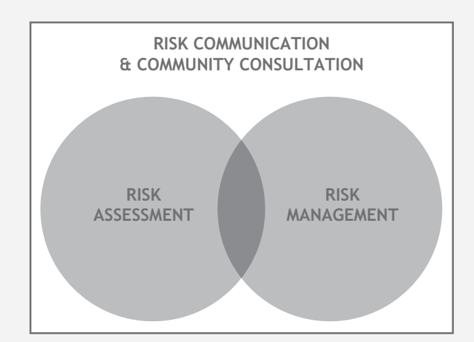
Figure 1: Relationship of risk assessment, risk management and risk communication. (Adapted from enHealth 2004)

Whilst the main focus of health risk assessment is the protection of human health, the benefits are not restricted to issues of health. If failure to conduct a thorough, well managed health risk assessment ultimately leads to a situation where significant adverse health effects are experienced, the flow-on effects can be significant. If the community believes that the appropriate steps to assess and minimise the risk to their health have not been properly carried out, then the level of community mistrust and anger can be very high. Regaining community trust in such situations is extremely difficult. Economic costs can also result and are not necessarily limited to the proponent. Loss of productivity and income, clean-up and monitoring costs, work required to ensure the situation does not occur again, cost of potential litigation, financial penalties and medical costs are all possibilities.