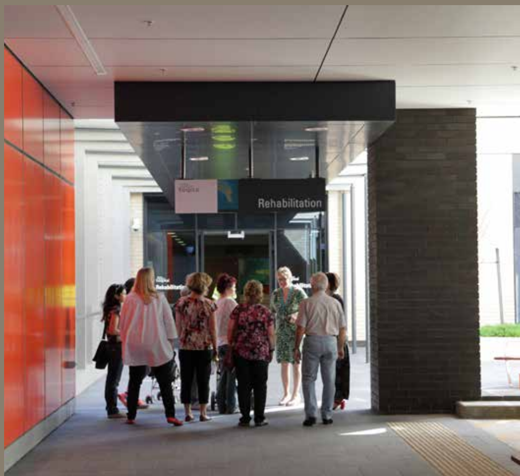
The group at the ground floor entrance to the rehabilitation building.

The visitors were taken through the new wards, rooms, therapy areas and gardens that will play a huge part in the rehabilitation journey for our newest patients.