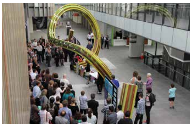
Over 100 people gathered in the concourse for the big announcement.