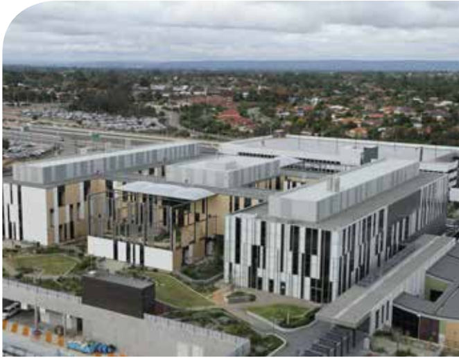
An external view of the FSH rehabilitation building.

As the first part of the hospital to open, the FSH State Rehabilitation Service contains 140 beds and has been designed to enhance the patient experience through functional therapeutic areas such as a hydrotherapy pool, gardens, kitchens, gyms and art and wood working rooms. Here is a look at what our new patients will see on 4 October 2014.