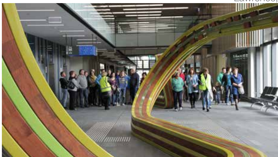
The tours filled the main hospital concourse.