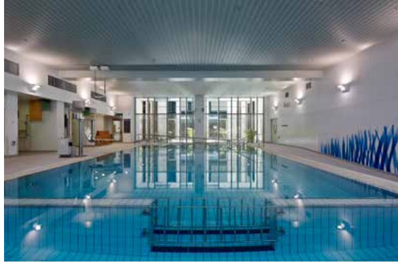
The hydrotherapy pool located on the lower ground floor.