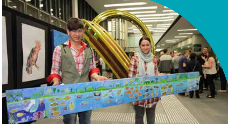
Students from North Lake Senior Campus with their group submission titled "Come swim with me under the sea".