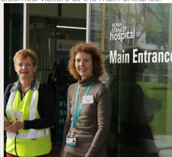
First look – visitors passed by the new rehabilitation building.