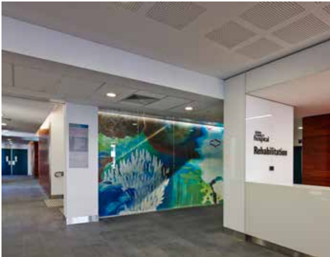
Artwork features throughout the building, such as at the main entrance and reception.