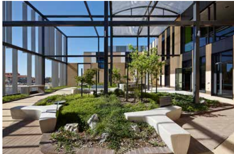
Courtyards and gardens provide a calm healing environment.

Emergency Department will open 3 February 2015